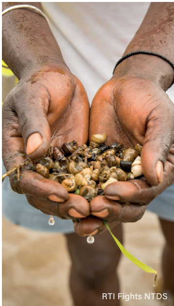
RTI Fights NTDS

Global health R&D at work in the Hawkeye State